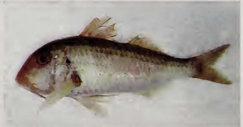
Fig. 6. Parupeneus fraserorum , SAIAB 82829, 117 mm SL, Madagascar. (Photo by Jessica Escobar-Porras).